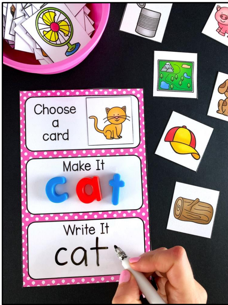
9. Make and Write Mats