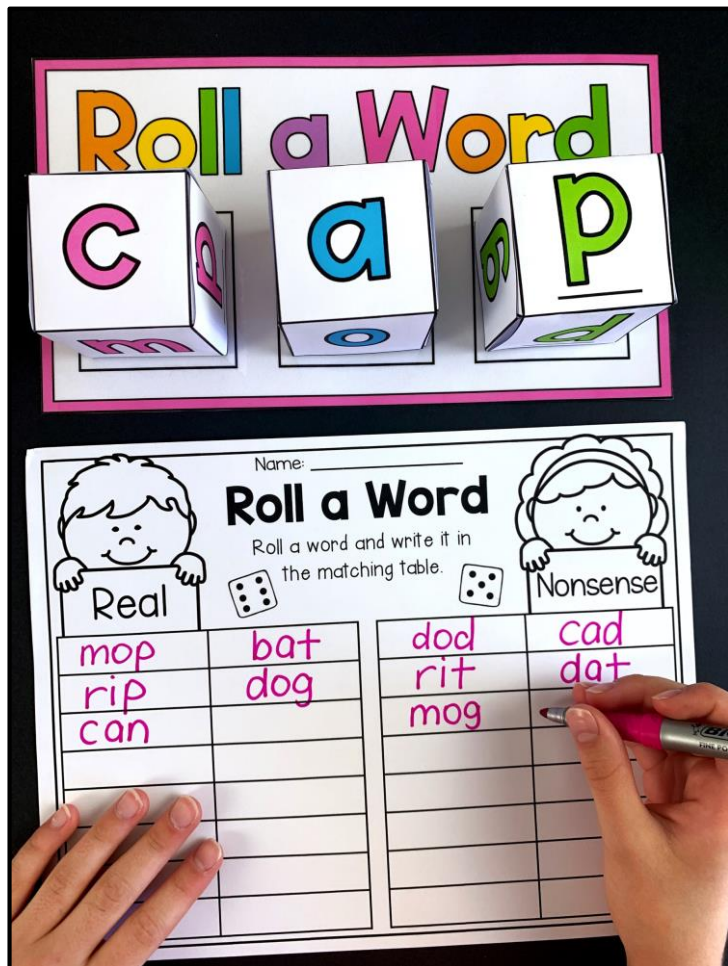
3. Roll a Word