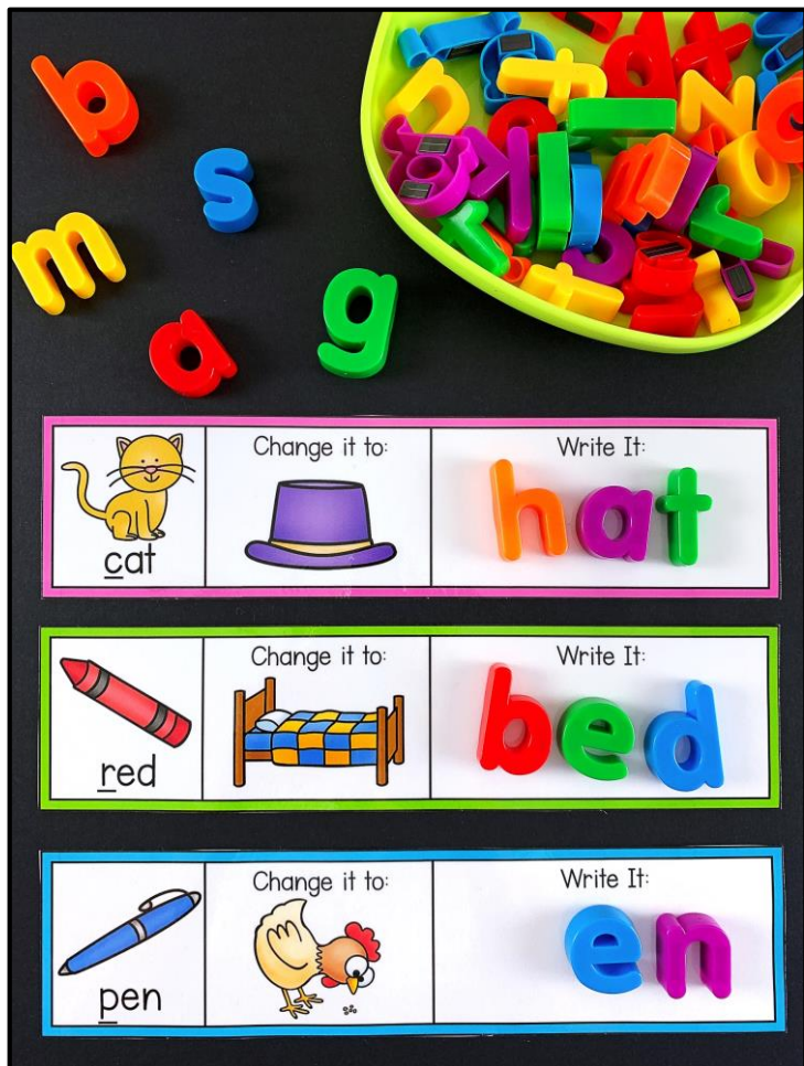
7. Change a Letter