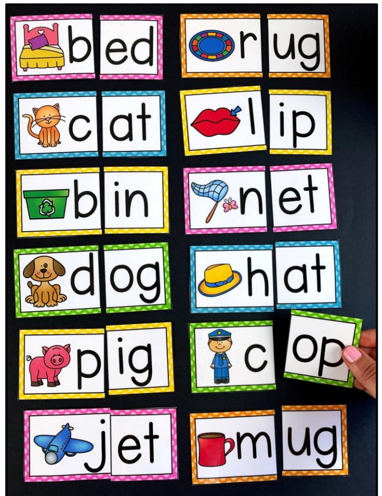
4. Onset and Rime Puzzle