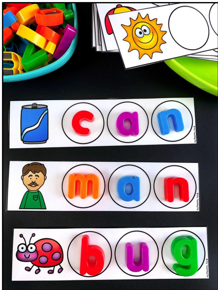
5. Spell a Word