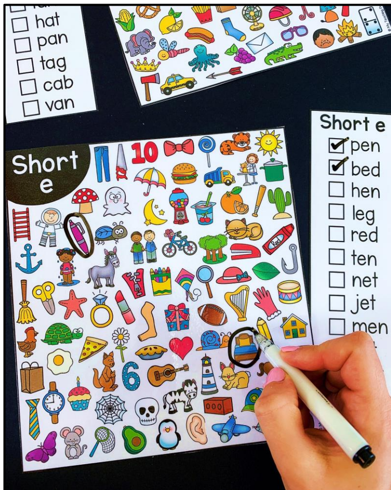
1. CVC I Spy