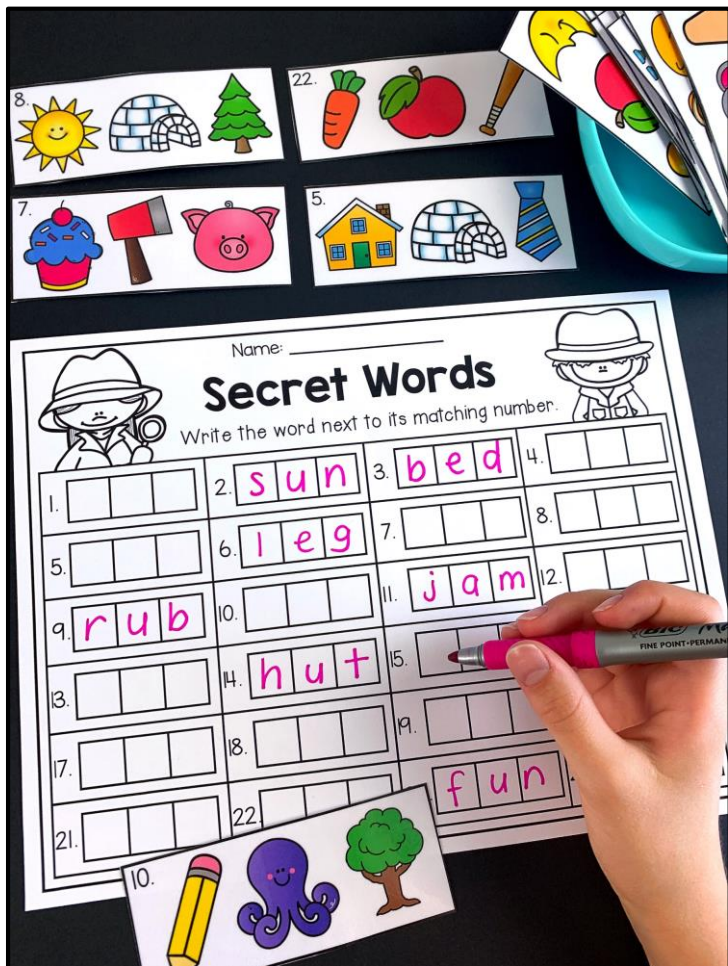
8. Secret Words