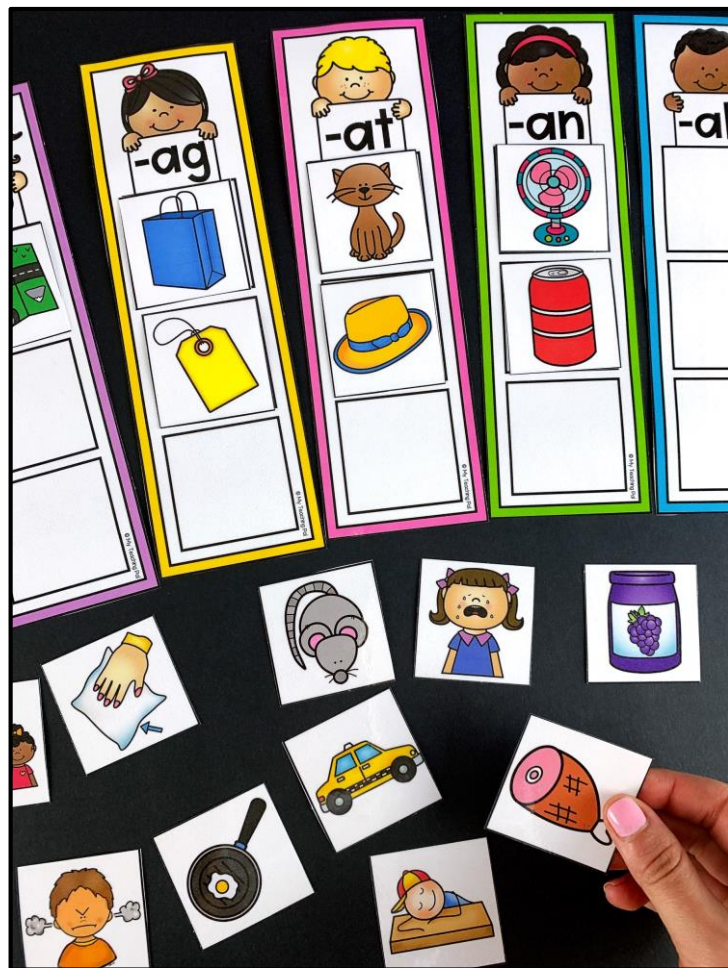
6. Word Family Match