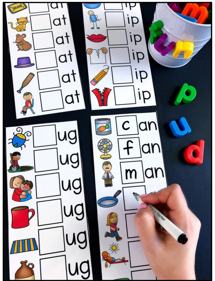
10. Word Family Strips