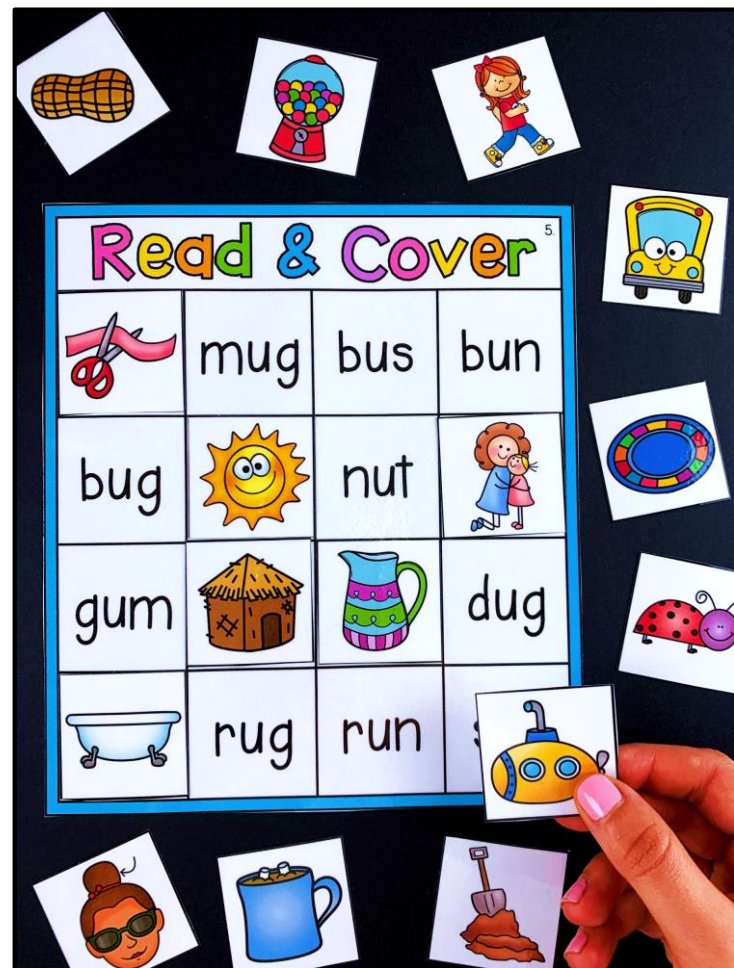
2. Read and Cover