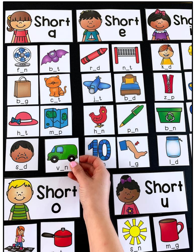
12. Short Vowel Sort